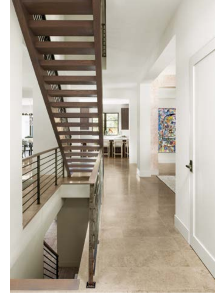
Previous spread: An open floor plan unites the family room addition with the kitchen. Beyond the main stair (above), the living room (below) is visible on the right; it features a Gregorius Pineo coffee table, a Holland & Sherry rug and an Ecocrete fireplace wall. In the dining room (opposite), chairs covered in a Holly Hunt pattern surround an iron-and-wood Formations table.