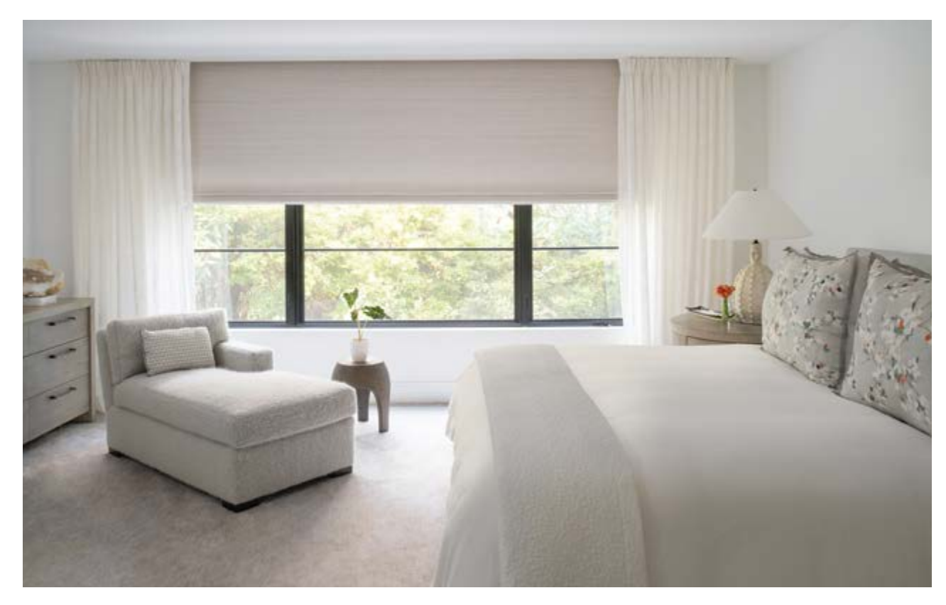
66 Great houses take details and repeat them in different ways. 99